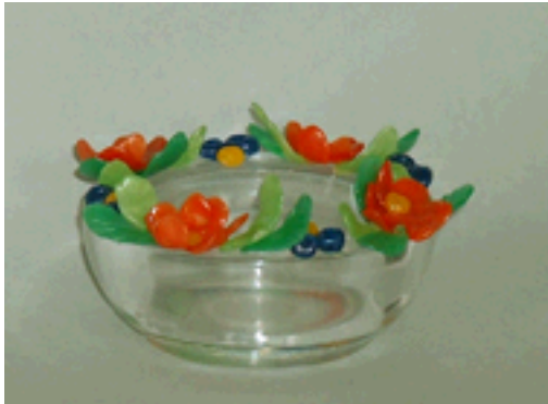
A Floral Wreath as Candleholder